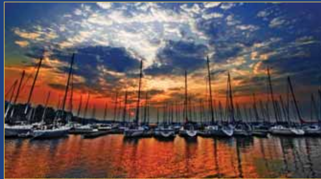
LaSalle Park Marina