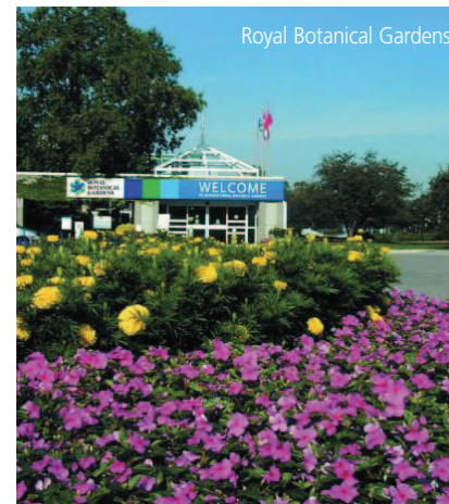
Royal Botanical Gardens

Meeting planners seeking an artistic flavour to their event will wish to consider Burlington Art Centre , a fascinating showcase for the visual arts and home to the work-