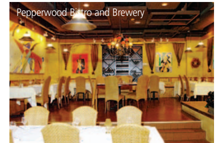
Pepperwood Bistro and Brewery

ing studios of seven craft guilds active in Burlington since the 1950's. Here is Canada's largest collection of contemporary ceramics, with over 1,600 pieces in the permanent collection, the work of 400 Canadian artisans. The Shoreline Room offers stunning views of the lake from floor to ceiling windows, seating 175 for dinner, and the intimate Fireside Lounge hosts 40. The open-air courtyard and gardens makes an inviting setting for cocktail receptions.