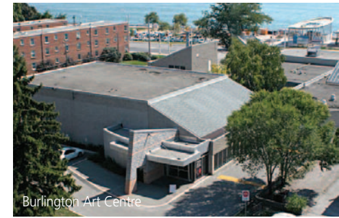
Burlington Art Centre