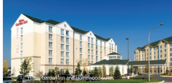
Hilton Garden Inn and Homewood Suites

Another delightful twin facility alongside the QEW at Burloak Drive is the Hilton